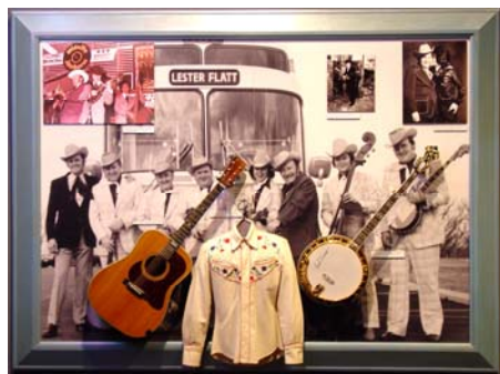
Lester Flatt memorabilia from Marty Stuart's private collection