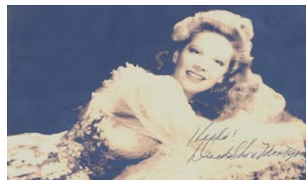
Dinah Shore

Following its premiere showing at the Tennessee State Museum, the exhibition will travel to other museums across the state for the next three years.