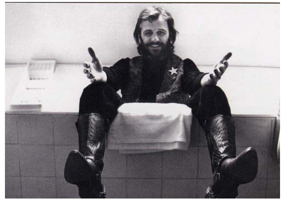
Ringo Starr by Nancy Lee Andrews